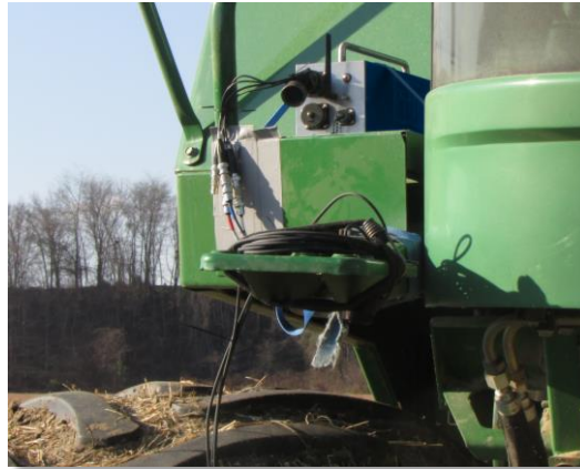
Figure 1. RAC-44-003 Collecting Acceleration Data

The RAC-44 is a rugged wireless 802.11 battery powered device that digitizes and streams data from strain gauges, accelerometers, thermocouples or voltage sensors to a remote computer using iTestSystem data acquisition software. This system is ideal for low channel count data acquisition on mobile or rotating equipment.